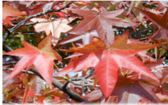
SWEETGUM LIQUIDAMBAR STYRACIFLUA

The second step was to research, draft and adopt a municipal tree ordinance. Once a tree ordinance was in place, a municipal tree board could be formed to plan and oversee future assessment, education, preservation, and replanting efforts.