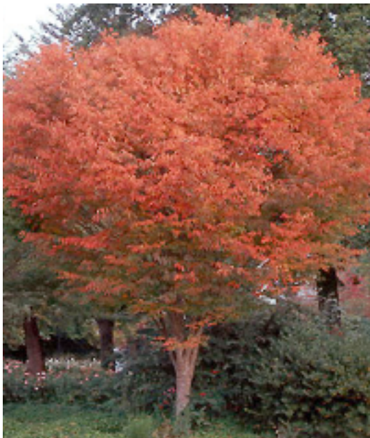
JAPANESE ZELKOVA ZELKOVA SERRATA