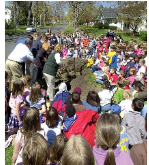
A WHITE SWAMP OAK IS PLANTED FOR ARBOR DAY 2006, COURTESY OF THE BANK OF CASTILE. STUDENTS FROM OAK ORCHARD ELEMENTARY SCHOOL HELP OUT.

The purpose of the ordinance is to protect the health, safety and welfare of both citizens and trees in the Village of Medina. It establishes needed standards to ensure good tree selection, proper planting and maintenance, and protection of trees within public right of way and public land. Many of the most beautiful villages, towns, and cities across America have such ordinances. The beauty of their municipal trees didn't just happen by accident- their tree boards and interested citizens work hard to create urban forests that are appreciated by residents and tourists alike!