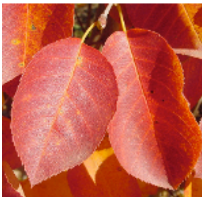
Amelanchier x grandiflora Autumn Brilliance Serviceberry

* Additional cultivars may be approved upon review by the Municipal Tree Board. Not all trees may be available at any given time.