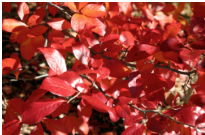
Nyssa sylvatica Blackgum or Tupelo