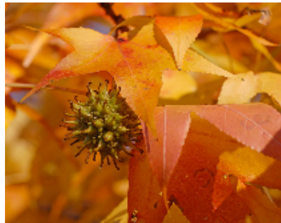
Liquidambar styraciflua American Sweetgum

* Additional cultivars may be approved upon review by the Municipal Tree Board. Not all trees may be available at any given time.