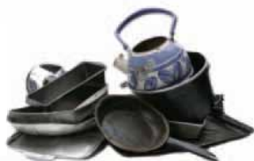
Kitchen Cookware Metal pots, pans, tins & utensils