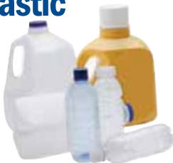
Plastic Jugs/Bottles/Household Plastic Empty containers only