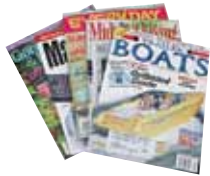
Magazines & Catalogs All types & sizes