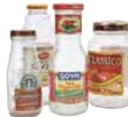
Empty & Clear Bottles & Jars Only