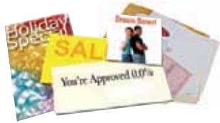
Office Paper & Junk Mail Envelopes, Flyers, Brochures, Postcards, etc.