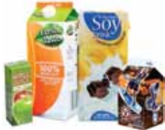
Food & Beverage Containers Empty containers only