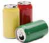
Aluminum Cans Empty cans only